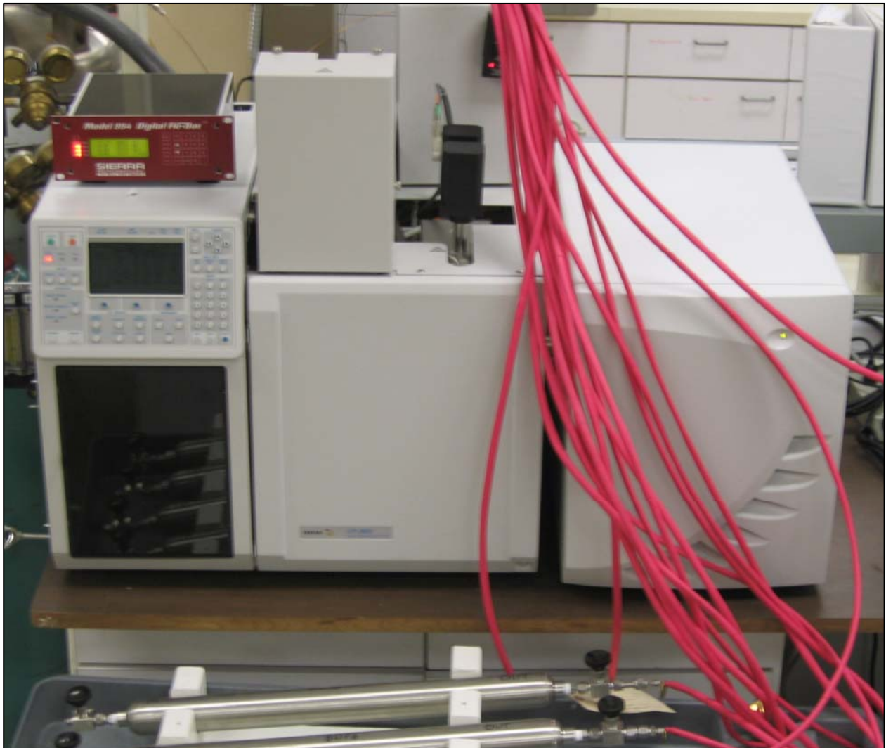
Satellite Gas Chromatograph not pictured.

For Total Sulfur, the mandated level of 4 ppb V/V requires a large sample volume be cryo-focused and then directed to a column for separation and then to a sensitive and selective pulsed flame photometric detector. The detected sulfurs are then mathematically summed to yield the total result.