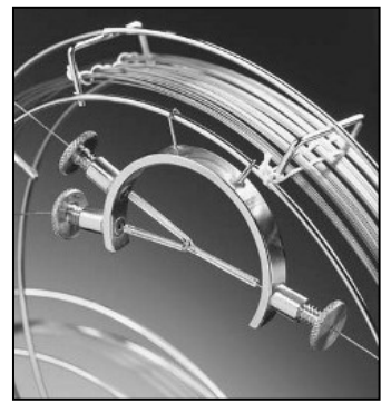
Figure 1. Typical column inlet splitter.

1. Both columns must match physical dimensions to ensure an even split, Inclusion of a mass spectrometer on one channel introduces separate flow rates for each side to due the inherent vacuum at the terminus of the column to the mass spectrometer. More sample will be pulled on this channel making quantitation of analytes more difficult. A restrictor to balance the restriction can be installed on the mass spectrum