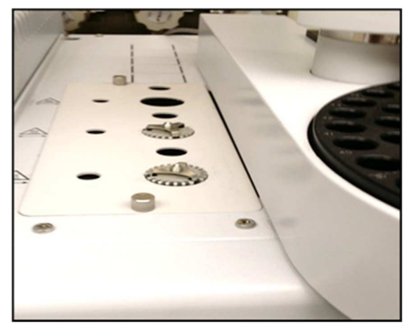
Figure 12. Manual injections are selected in SampleList column "Injectors Used.

Lotus Consulting 310/569-0128 Email: randy@lotusinstruments.com