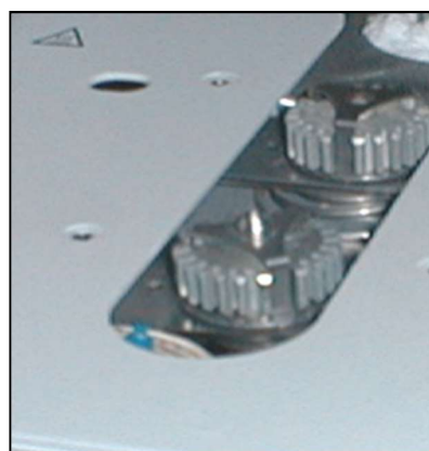
Figure 1. Photo of finned injector nut, with an injector switch to start chromatographic run on injection.

Varian/Bruker/Scion Gas Chromatographs, since the introduction of the Varian Vista 6000 in 1979, are designed to reduce the temperature at the septum location, even with extremely high injector temperatures. Use of a finned injector nut radiates heat away from the septum area to reduce thermal effects on the septum and lengthen its useful life. Figure 1 is a photo of the finned nut mounted on an injector. The lower temperatures realized for the septum area and injector nut are measured with a thermocouple probe that is inserted through the injector nut and into the septum to emerge at the inside septum surface (Figure 2).