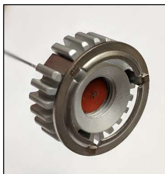
Figure 2. Photo of finned injector nut with probe inserted through septum to measure surface temperature.

Results are summarized in Figure 3. These lower temperatures extend the life of septa without restricting temperature operations of the injector.